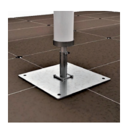
Stainless steel plate screwed onto floor system