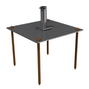
Stainless steel plate with tent stakes / screw anchor